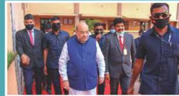
Honorable Shri Amit Shah, Minister of Home Affairs