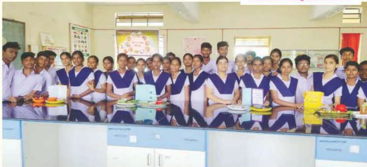
Nutrition cooking demonstration