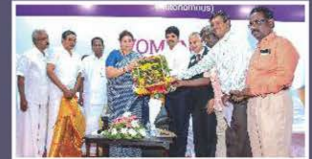
Honorable Textile Minister Smt. Smirti Irani