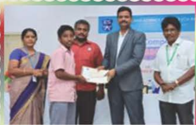
Picasso'22 - District Level Drawing Competition.