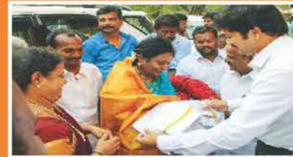
Dr. Tamilisai Soundararajan, Governor of Telangana