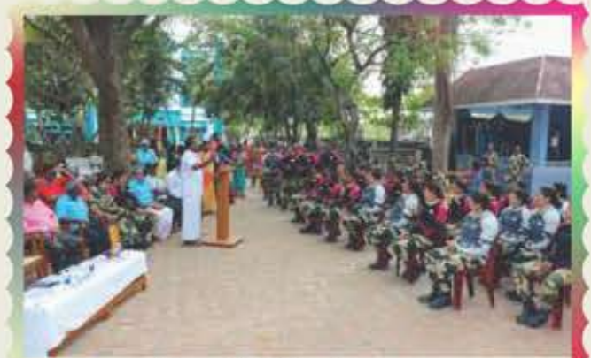
Women's Bike Riders Programme