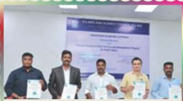
National Seminar on "Recent Trends in Plant Science and Atmospheric Physics" organized by Department of Botany and Physics. Mission Threads" Organized by the Department of Computer Science and Mathematics.