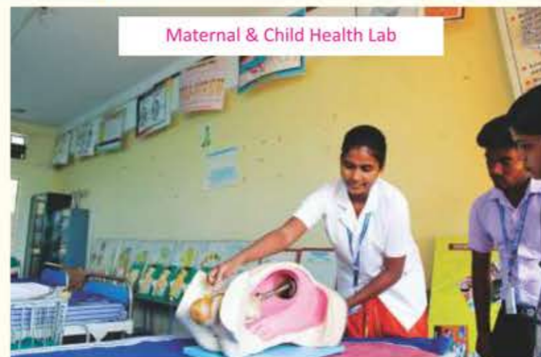
Maternal & Child Health Lab