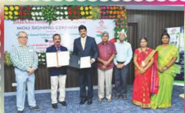
MOU signing Programme with AIMST University