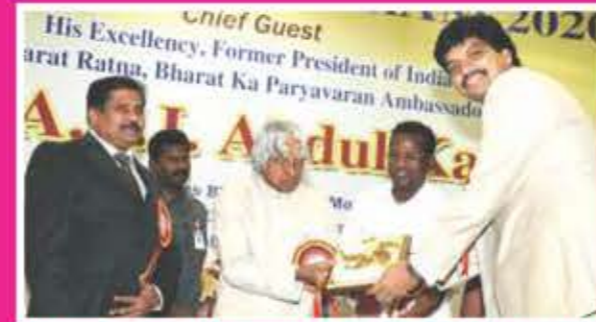
Lead Villupuram 2020 His Excellency Former President Dr. A.P.J. Abdul Kalam.