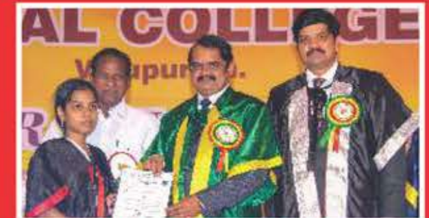
Dr. Mylswamy Annadurai, Indian Scientist